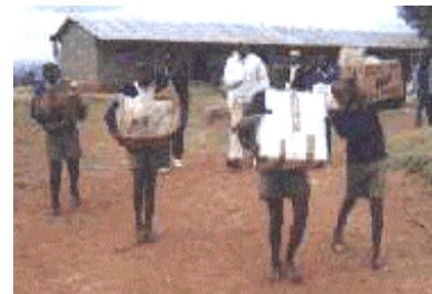
African students carrying used American textbooks they received through the Books for Kenya Project.

The first need evident to the American teacher was the need for educational resources for the students and teachers. Her letters home indicated this fact and several of her friends began sending small items in an effort to compensate for the lack of resources. Paper, pencils, erasers and sharpeners were the first items to reach the African students. After she arrived home, a drive to send used American textbooks and ship them to Africa ( Books for Africa ) was initiated and achieved.